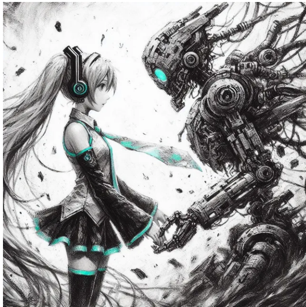
Hatsune Miku faces a machine.

Project Sekai: Colorful Stage! feat. Hatsune Miku is a Japanese mobile rhythm game featuring Vocaloid-based artists. As you may know, Project Sekai CTF has its namesake originally derived from this game.